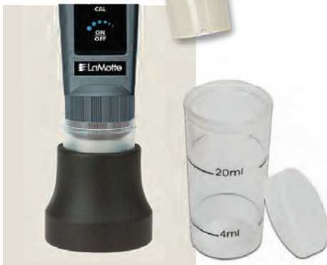
Weighted Stand Code 1746